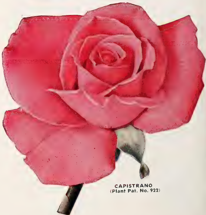
CAPISTRANO (Plant Pat. No. 922)